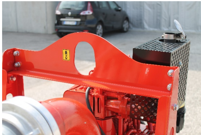
Loop hole to lift the pump

WARNING Never move or lift the pump while it being in operation or with connected lines.